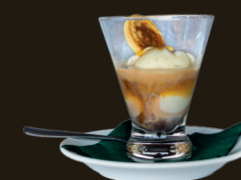
MILSA CAFÉ GELADO

Vanilla ice cream scoop, Kahlua, Amaretto, Shot of espresso