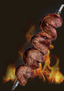
PICANHA BEEF SIRLOIN